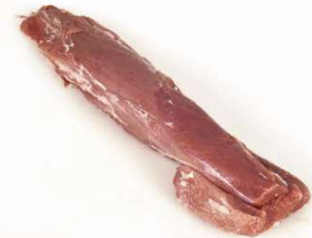
3 Fillet of pork fully trimmed. Cut fillet into 25 mm thick medallions and place on skewers.