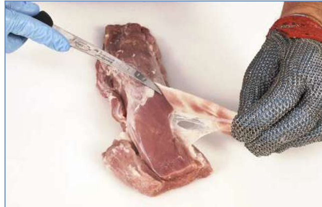
2 Remove the chain, silverskin and fat.