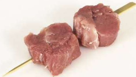
4 Fillet of Pork – skewers.