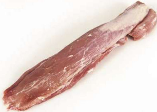
1 Fillet of pork.